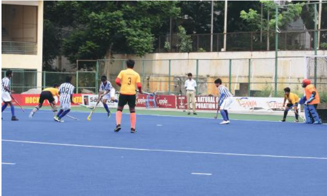
SJBHS blanked Vidya Shilp Academy 5:2 in the U-14 finals to lift the Eric Vaz Trophy & in the U-17 category; Vidya Shilp Academy beat Baldwin Boys 2:0 to lift the Centenary Shield .