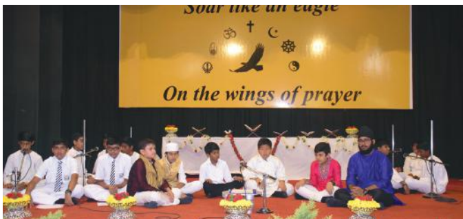
INTER RELIGIOUS PRAYER SERVICE -At SJBHS the universal religion is love, brotherhood and humanity