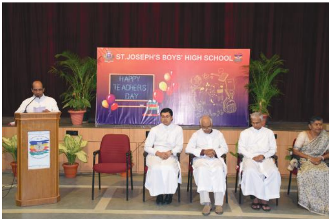
TEACHER'S DAY CELEBRATIONS: Father Principal greeting the teachers on 5th Sept; a special wish from the management of SJBHS