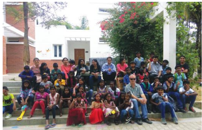
THE CLC BOYS AT THE JEEVARATNI HOME for Abandoned Children in Nallur, on the 1st of July, 2017. At SJBHS, being socially sensitized to the needs of the under privileged goes hand in hand with academics.