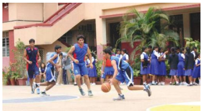
The SJBHS U-16 Basket Ball Players were Runners Up in the Clarence School COPA Tournament