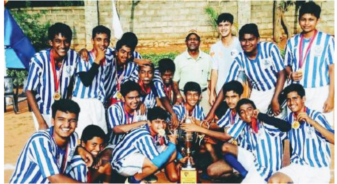
The SJBHS U-16 team beat Vidya Shilp in the finals of the Inter School Hockey Tournament hosted by Vidya Shilp Academy held in August, 2017.