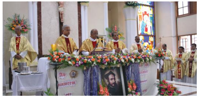
FESTAL MASS: A concelebrated mass to commemorate the life, works and ideology of St Ignatius of Loyola, the founder of Jesuits.